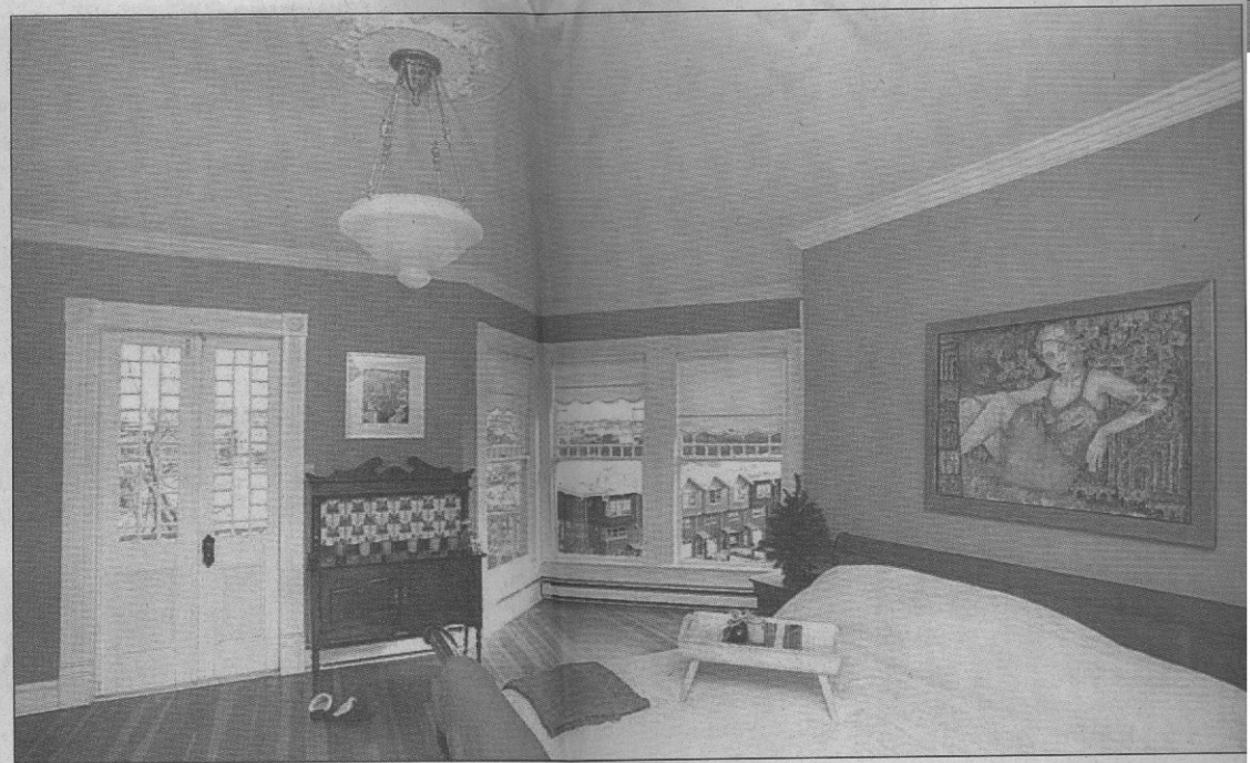
The master bedroom welcomes with rich fir floors and a view of the Gorge waterway.