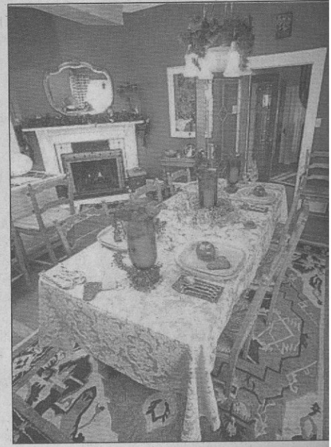
The dining room is perfectly suited for family meal-time gathering.