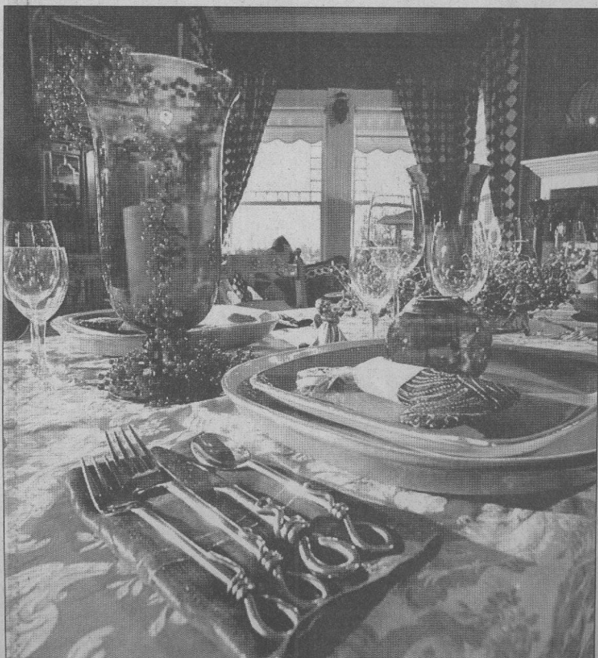
Candles in red glass holders, adorned with scarlet beads, make a festive table.

"This is a family home. It's very much lived in," says Shellie. "We don't try to make it a showhome. There's too much action in here to allow that."