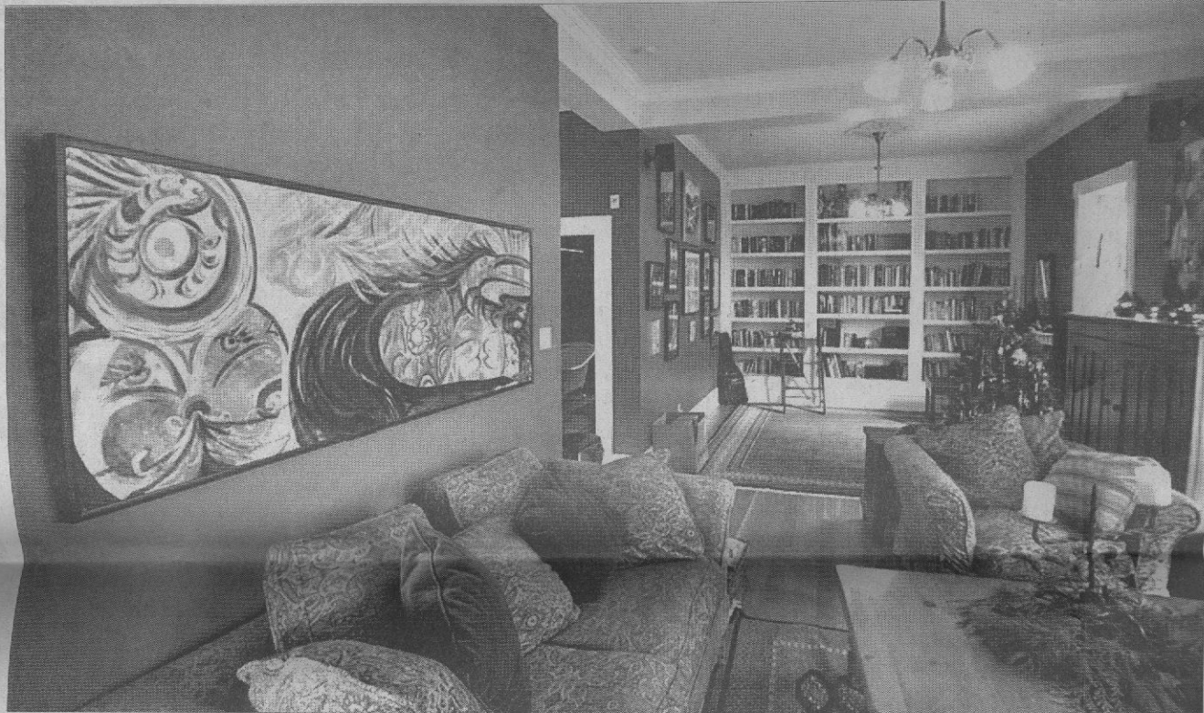
The library is adjacent to the sitting room, which is a handy arrangement for the voracious reader.