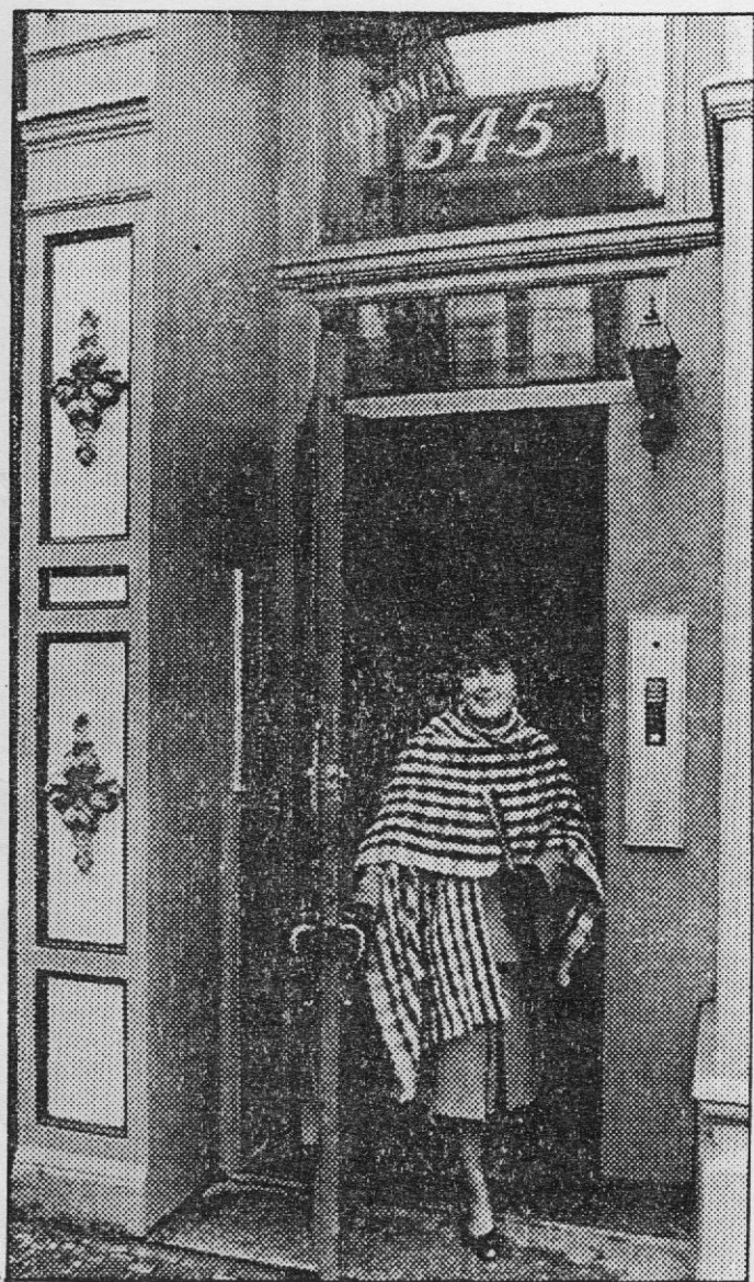
■ NICOL: new splendor for an old hotel.