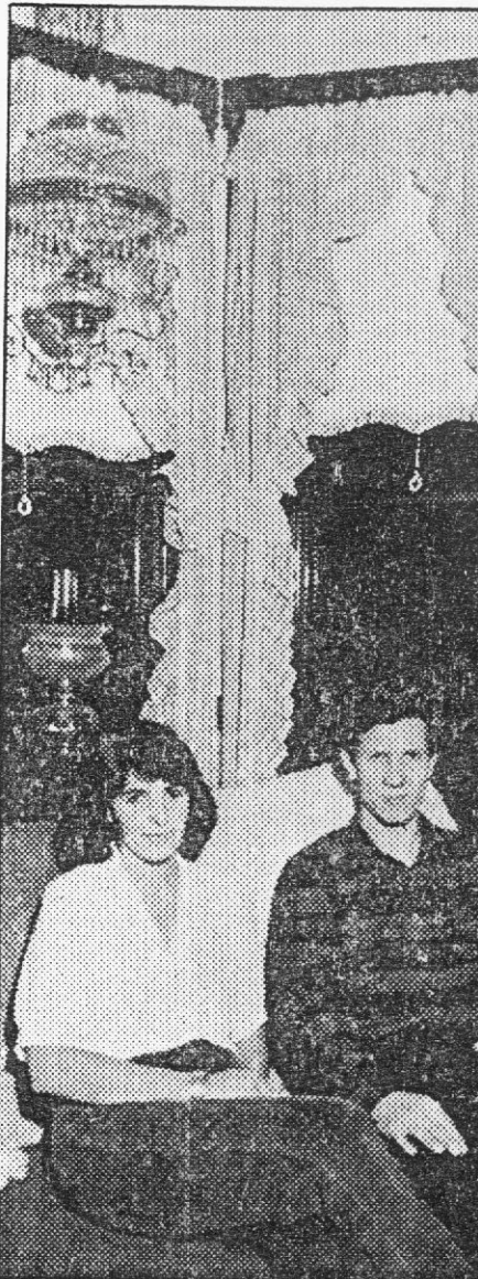
■ THE BULMERS: a long labor of love