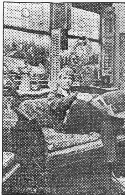
■ PUTNAM: 7-year joint project.

They re-papered and painted the interior, and painted the exterior green with brown-wine trim.