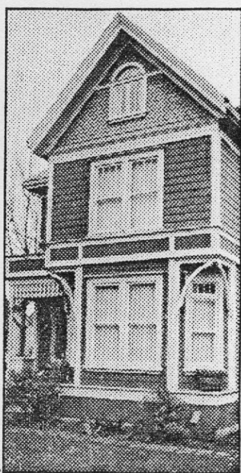
■ HUNTINGTON PLACE.