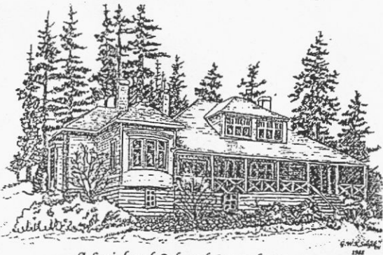
A Social and Cultural Centre for Seniors

c/o 3910 Rowley Road Victoria, British Columbia V8N 4C2