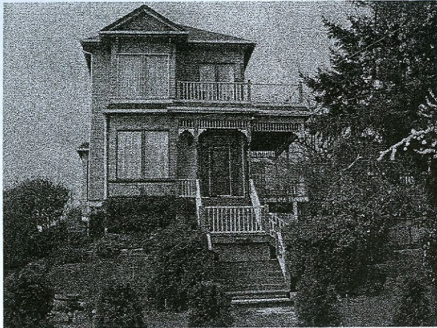
502 Catherine Street, 2001