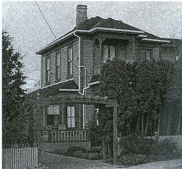
332 Catherine Street, 2001