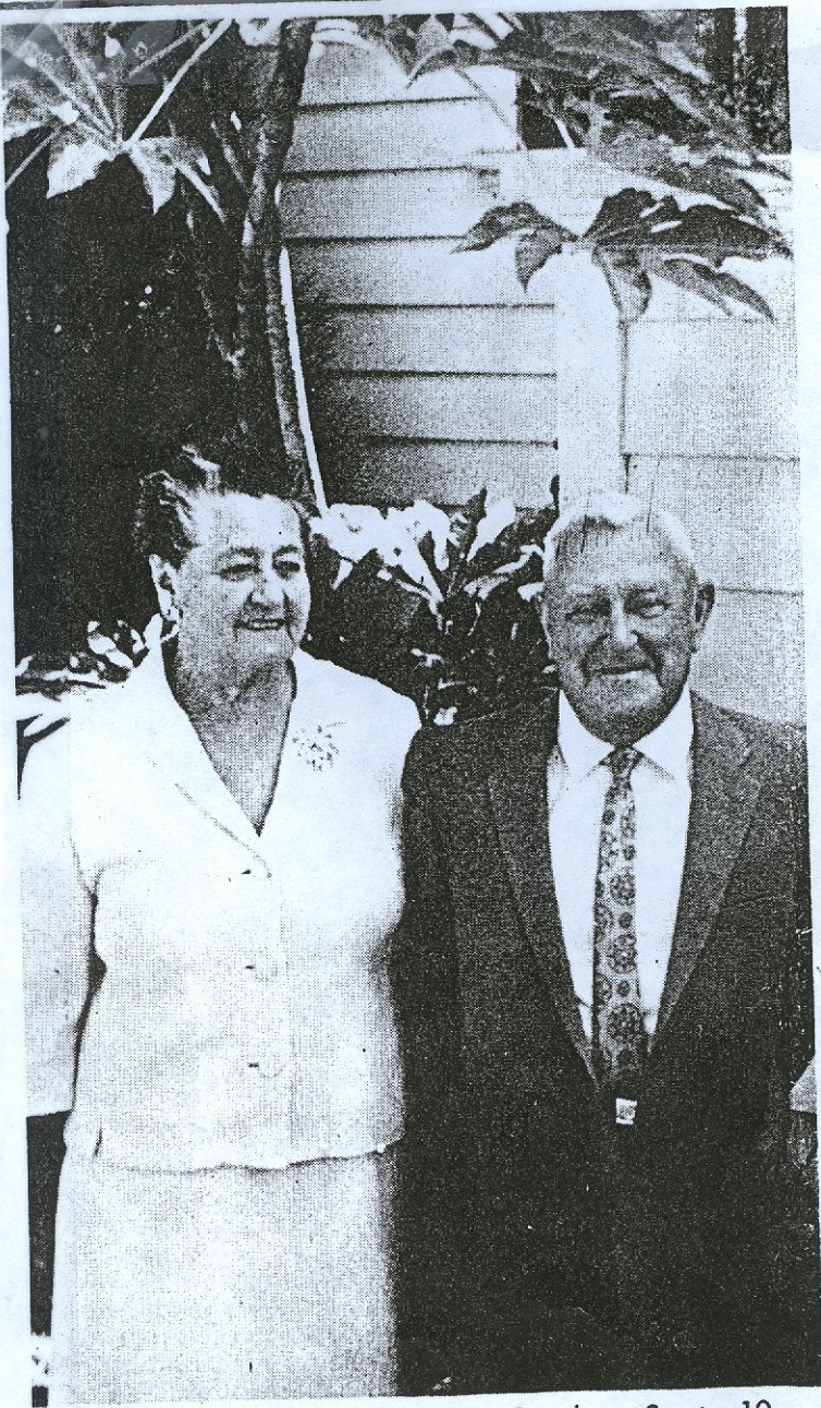
Will celebrate the occasion Sunday, Sept. 10