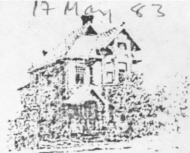
The Baker House

968 BALMORAL ROAD (CORNER VANCOUVER STREET AND BALMORAL ROAD) VICTORIA, BRITISH COLUMBIA V8T 1A8 TELEPHONE (604) 384-4411