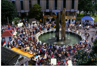
Centennial Square during FolkFest, July 1985

More information on the Friends of Centennial Square