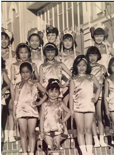
Charlayne -front center, c 1964, City Hall in background

Your voice for heritage in the Capital Region and the Islands since 1973