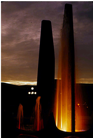
Centennial Square fountain at night December 1964

More information on the Friends of Centennial Square