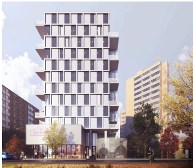
17092 Quadra - Proposal approved at COW meeting Sept 14, 2023.