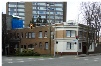
1702 Quadra, existing Abby

Book a free ticket for Sept. 26 lecture.