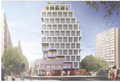
1702 Quadra - Proposal of December 2021