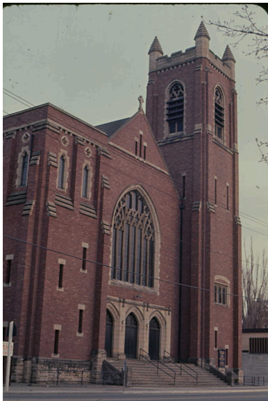
First United Church - Balmoral & Quadra

the Abby Apartments, a two-storey brick building constructed circa 1915. The current plan fails to preserve the façade although they say they will try and re-use some of the old bricks and there will be a stainless screen illustrating the original owners, similar to the screen that can be seen on the Amazon facility out near the airport.