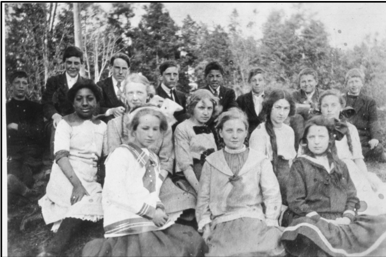
Photo 8 - THE LAST CLASS AT CRAIGFLOWER – 1911. BC Archives G-02294

This BC Archives photograph is titled “Last Class” but it would appear the subjects are older than one would expect. They may well be former students who posed for the picture in 1911 upon the closing of the old school.