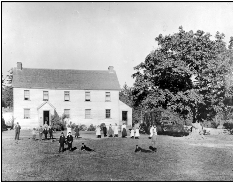
Photo 2 - CRAIGFLOWER SCHOOL - UNDATED.

This BC Archives photograph is undated but, from the appearance of the children's dress and the landscape, would appear to be in the late 1880s or early 1890s.