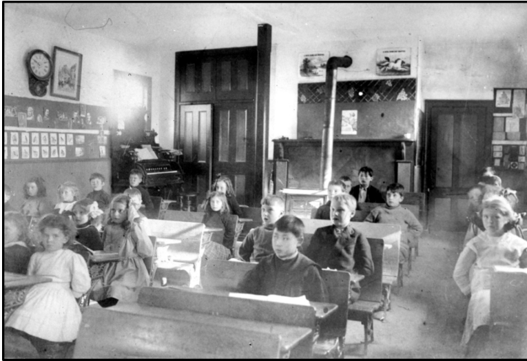
Photo 7. CRAIGFLOWER SCHOOL, DIVISION 2, 1911.