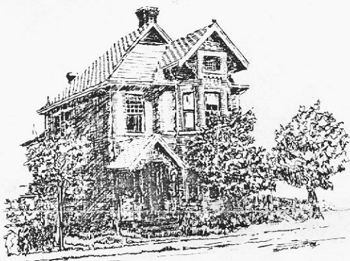
The Baker House

special guided tour of Nanaimo's many historical and heritage sites and a visit to the Museum. Enroute, we will stop and view the Chemainus Murals. Our thanks to the Nanaimo Historical Society.