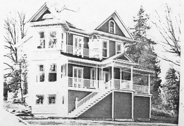
1140 CURRIE LANE