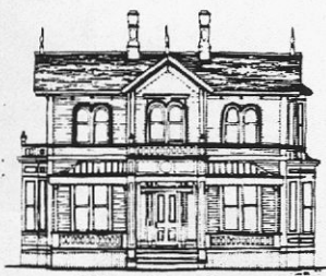
Richard Carr House