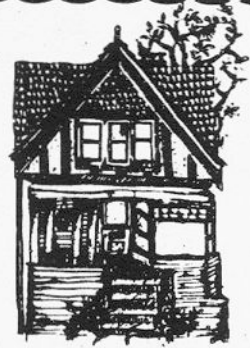
The Bantly House Tearoom Victoria

Tuesday through Saturday Sunday 1:00 p.m. to 4:00 p.m. Closed Sundays