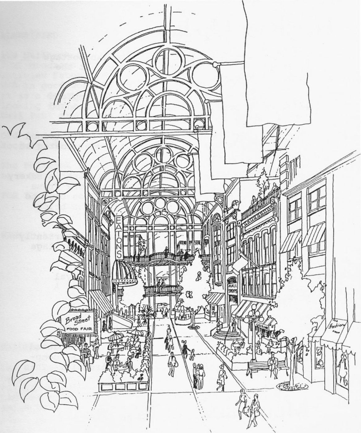
An alternative proposal for Broad Street from The Hallmark Society. The design would retain Broad Street and all ten heritage buildings.