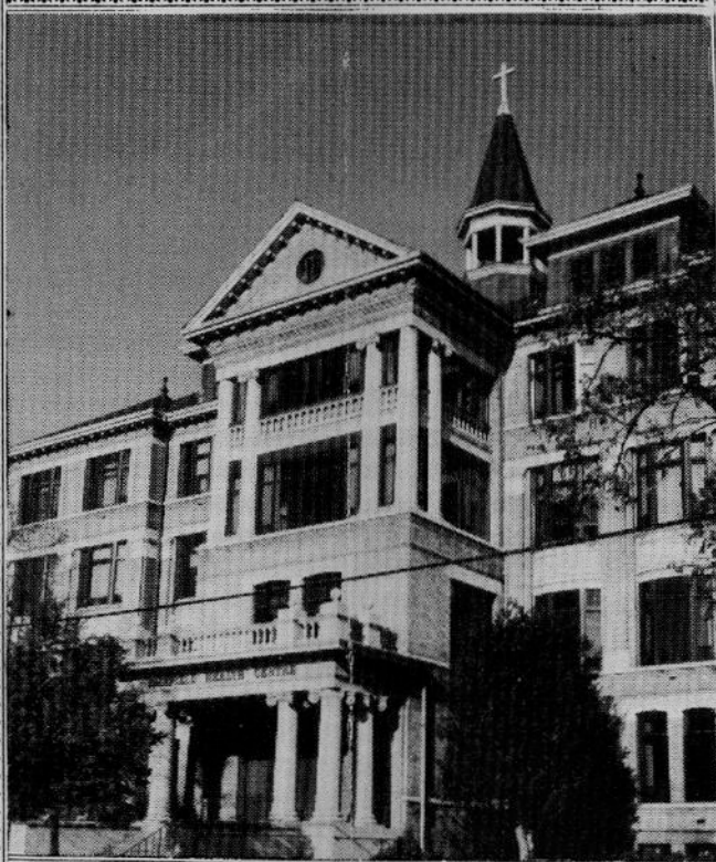
ST. JOSEPH'S HOSPITAL

Since 1973, Your Voice in Heritage Preservation in the Capital Region Richard Carr House, 207 Government St., Victoria, B.C., Canada V8V 2K8